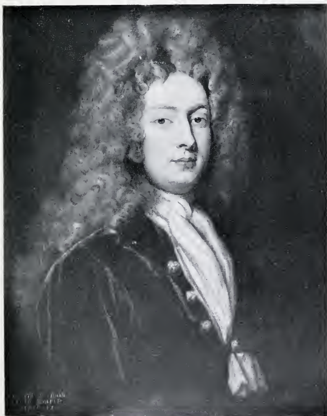
after the picture by Sir Godfrey Kneller in the National Portrait Gallery.