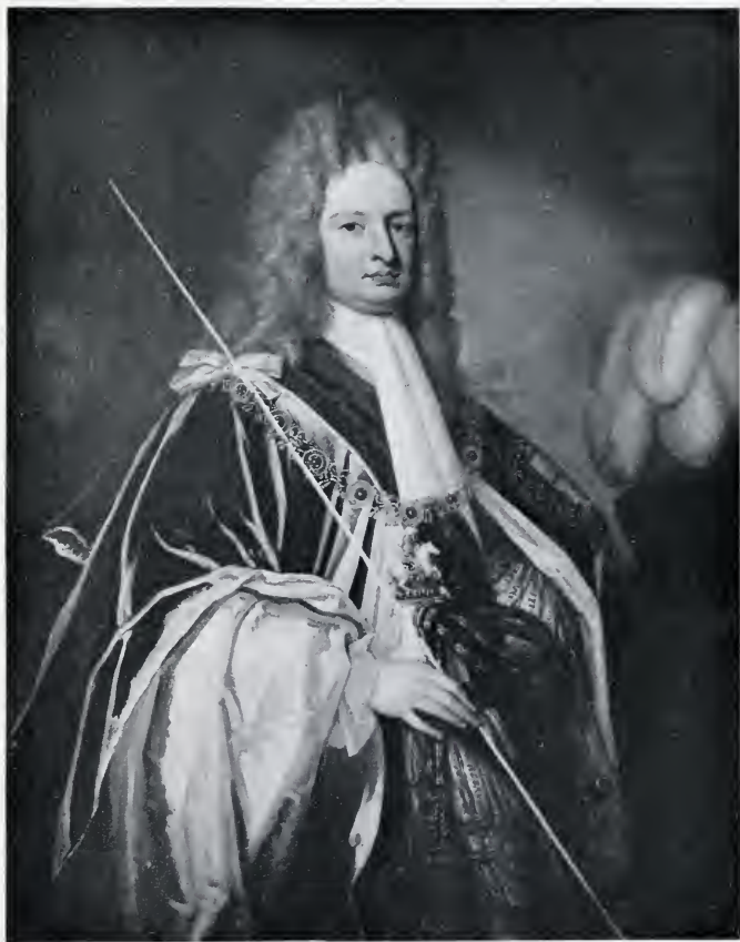
after the picture by Sir Godfrey Kneller in the National Portrait Gallery.

ROBERT HARLEY, EARL OF OXFORD AND MORTIMER, K.G.