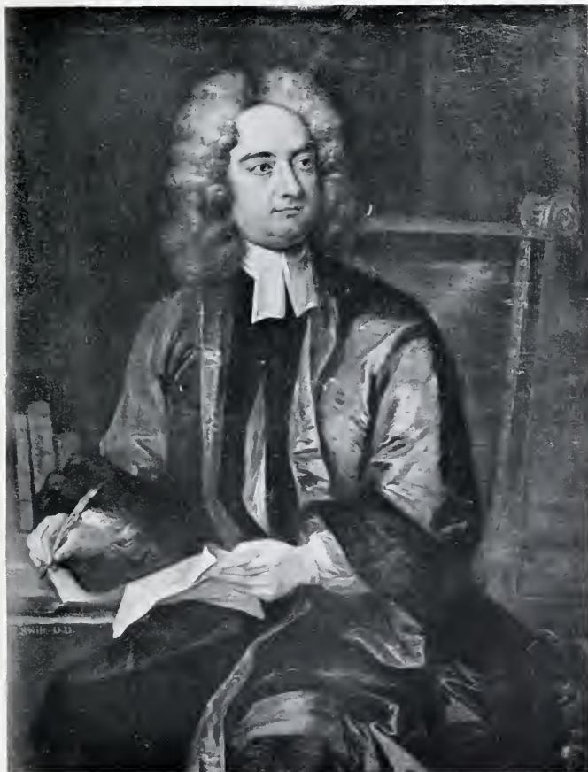
From a photo by Emery Walker, after the picture by Charles Jervas in the National Portrait Gallery.