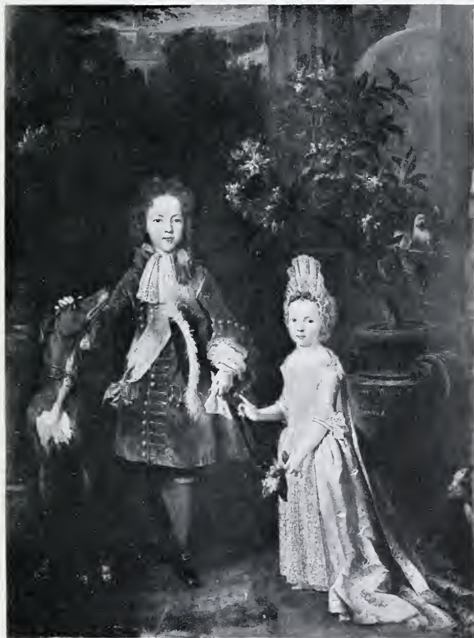
after the picture by Nicolas de Largillière in the National Portrait Gallery.

QUEEN ANNE'S BROTHER, PRINCE JAMES, AND HER SISTER, THE PRINCESS LOUISA, EXILES AT THE COURT OF FRANCE.