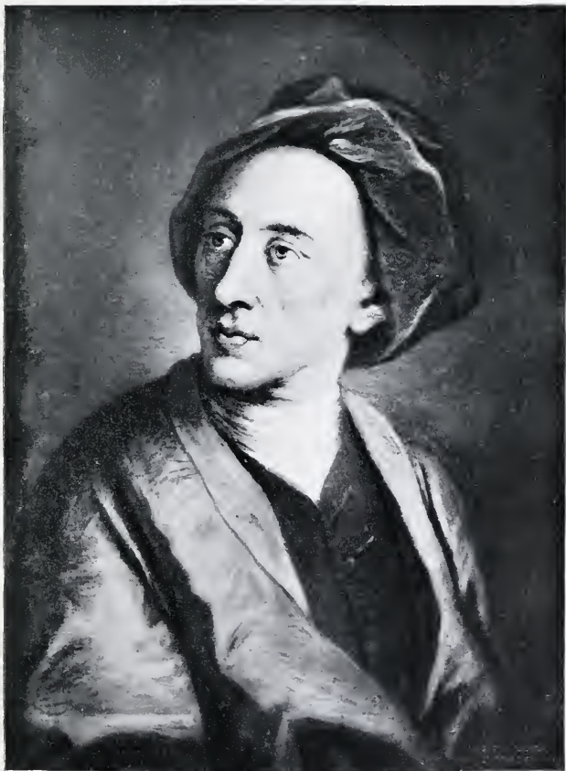
after the picture in the National Portrait Gallery attributed to William Hoare, R.A.